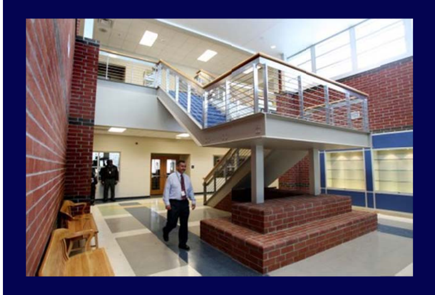
Haut Gap Middle School