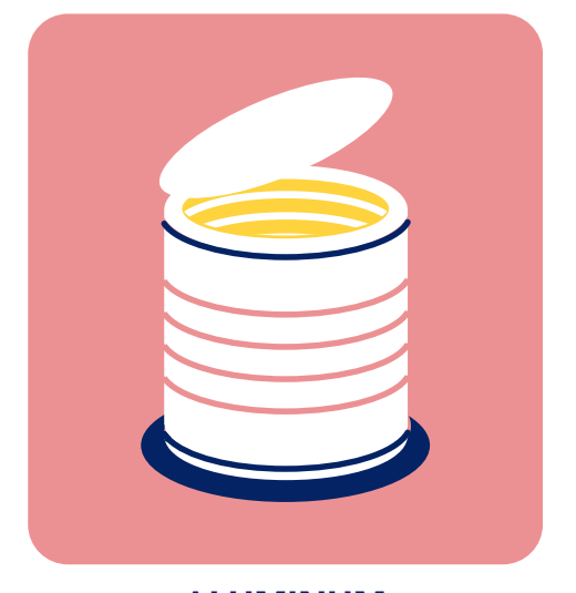
ALUMINUM & STEEL CANS