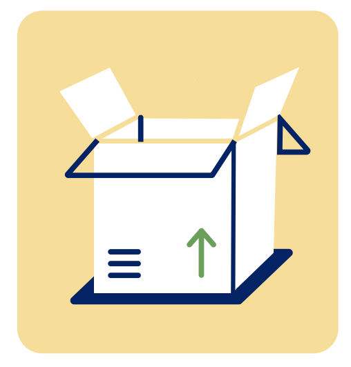
PAPERBOARD & FLATTENED CARDBOARD