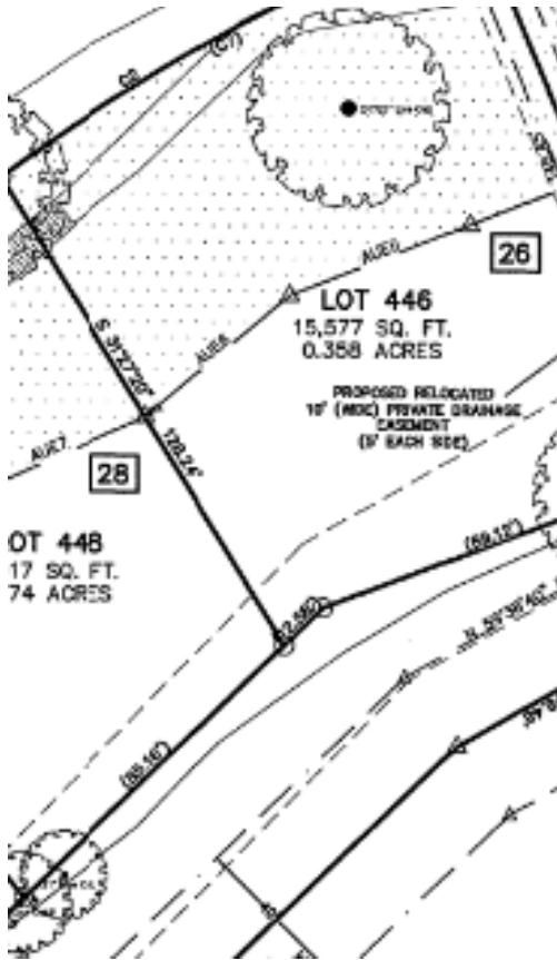
Plat Information Example