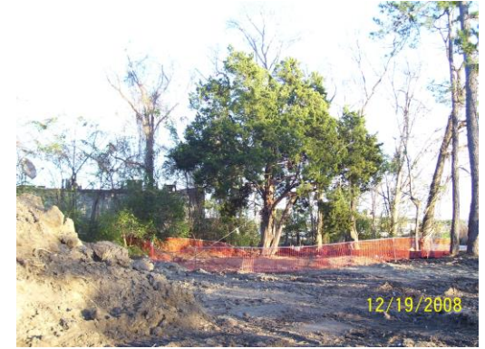
Tree Protection Fencing

Article 9.2 of the Charleston County Zoning and Land Development Regulations Ordinance (ZLDR) .