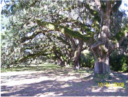
Grand Live Oak Trees